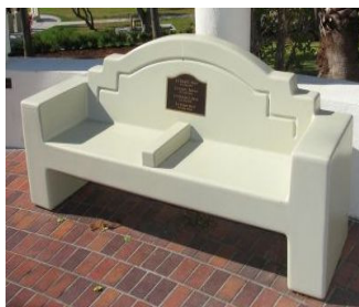
3 Seat Bench

A 3 Seat Park Bench with a large engraved plaque recognizing your generous support