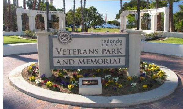
Veterans Park, 300 The Esplanade

To continue to enhance and preserve in perpetuity this memorial honoring all past, present, and future veterans of the United States of America.