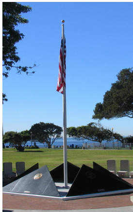
Flag Pole & Star

with a 3 inch by 12 inch engraved plaque recognizing your generous support