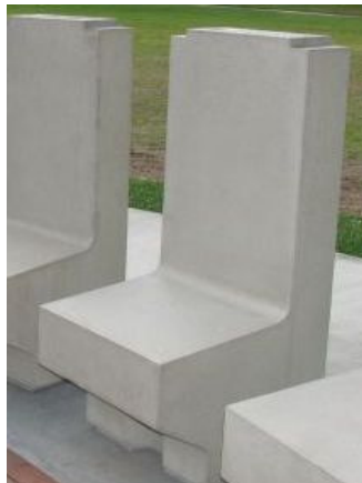
Single Seat Chair

A Service Pyramid with a 3 inch by 12 inch engraved plaque recognizing your generous support